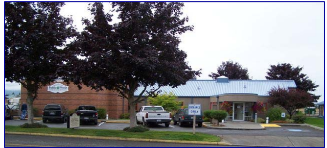
Public Works Offices

plays a major role in the planning for the City's future, with the Public Works Director working closely with state agencies to secure grant and loan funding for the City's capital projects.